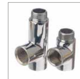
Chrome 75mm & 50mm