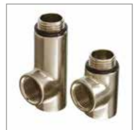
Brushed Nickel 75mm & 50mm