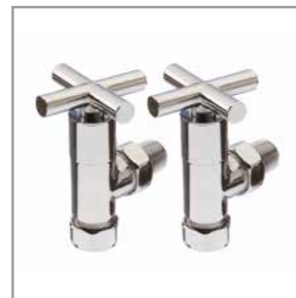
LIVINGSTONE Valves from £45.60 (p.62).