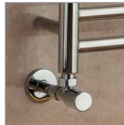
DRAKE Valves from £38.40 (p.62).