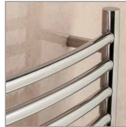
LANARK Curved option.

Lanark Curved Pipe centres left to right = Width less 32mm Pipe centres from wall = 84mm Depth from wall = 136mm