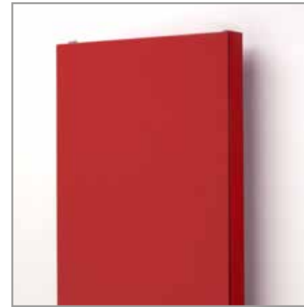
FARADAY Type 21 (P+) Vertical in RAL 3000.