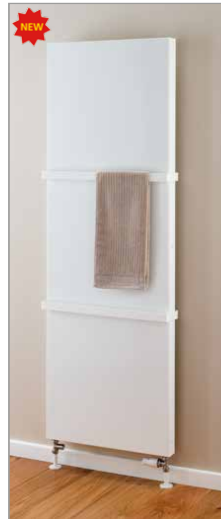
FARADAY® Type 21 (P+) Vertical with optional Towel Bars.