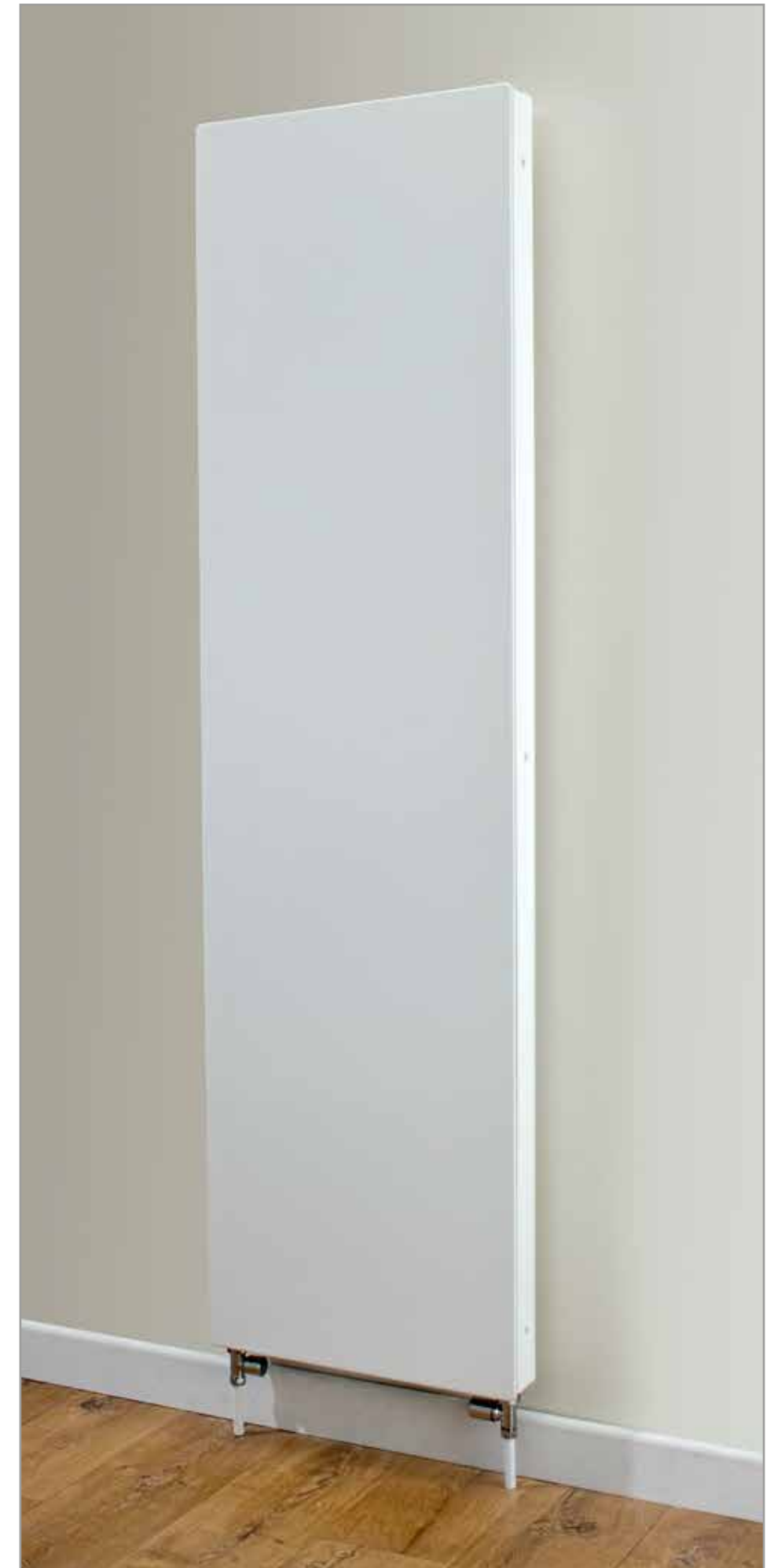
♦ FARADAY® Type 21 (P+) Vertical 1800mm x 500mm shown with DRAKE Valves.

25 RAL colours available; delivery in up to 15 working days, see pages 10-11 for more information.