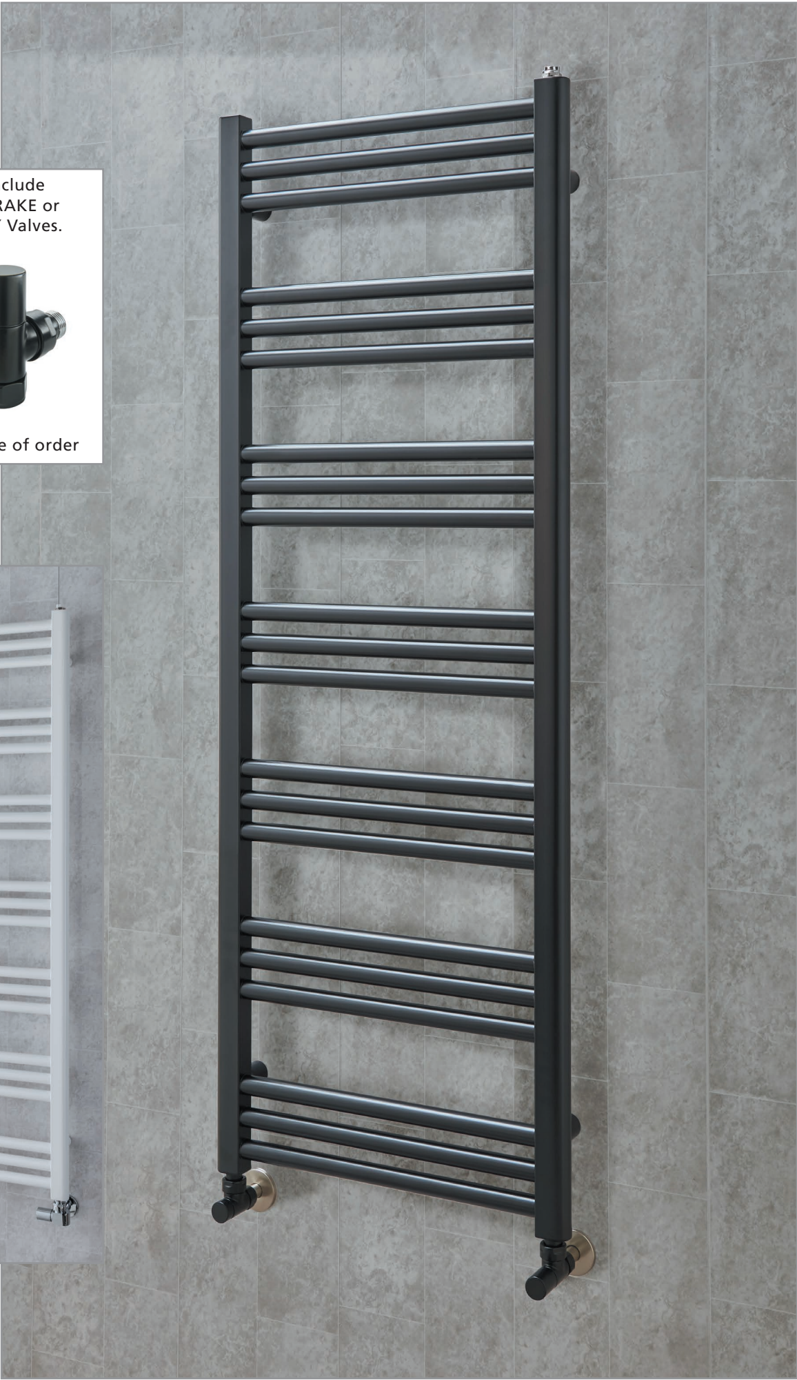
♦ WINSFORD Ladder Rail 1374mm x 500mm in Textured Anthracite shown with matching SHELLEY Valves.