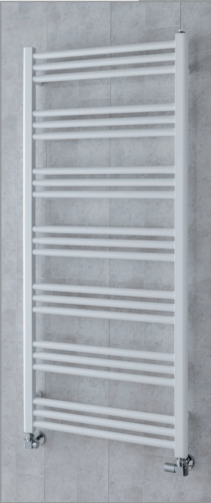
1374 x 600 in White RAL 9016