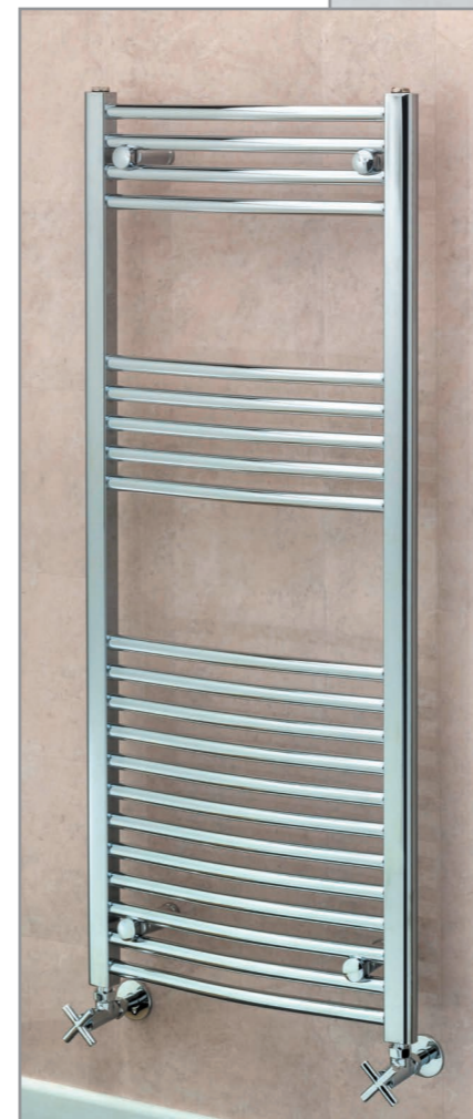
Curved with LIVINGSTONE Valves