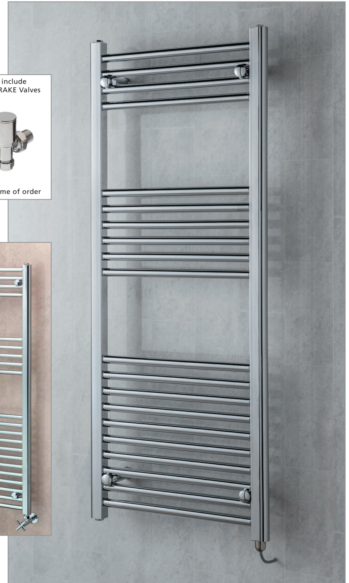
◆ ARGYLL Electric Straight 1200mm x 500mm 300 watts.