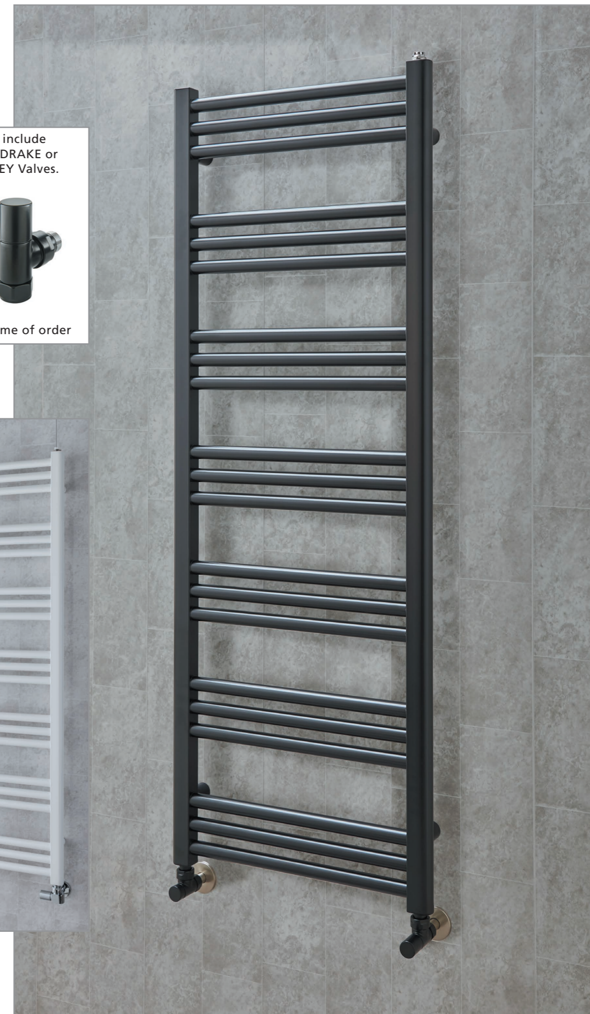
◆ WINSFORD Ladder Rail 1374mm x 500mm in Textured Anthracite shown with matching SHELLEY Valves.