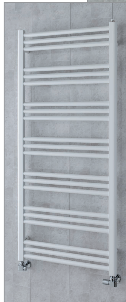
1374 x 600 in White RAL 9016