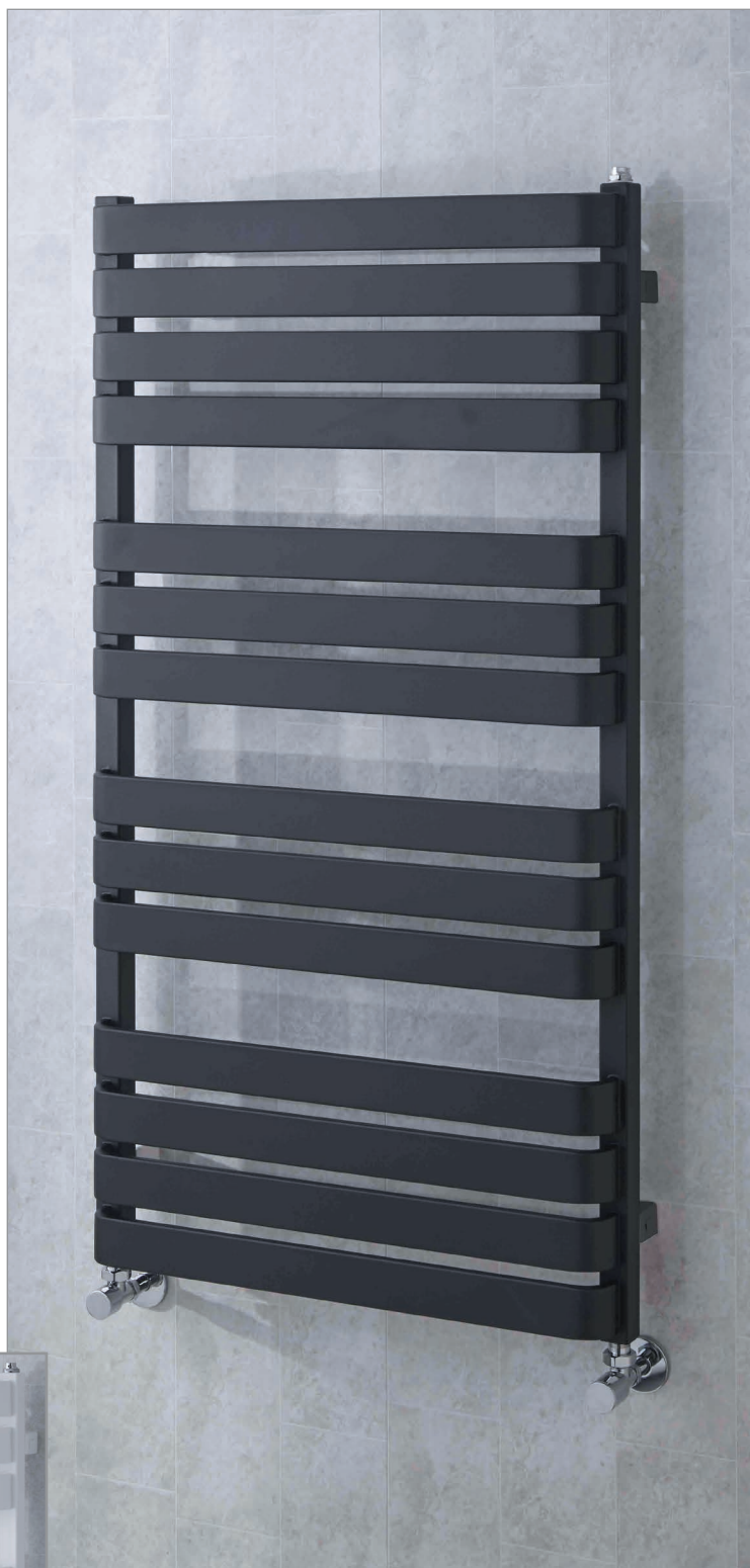
◆ 1110mm x 600mm in RAL 7016 Anthracite Grey & DRAKE Valves.