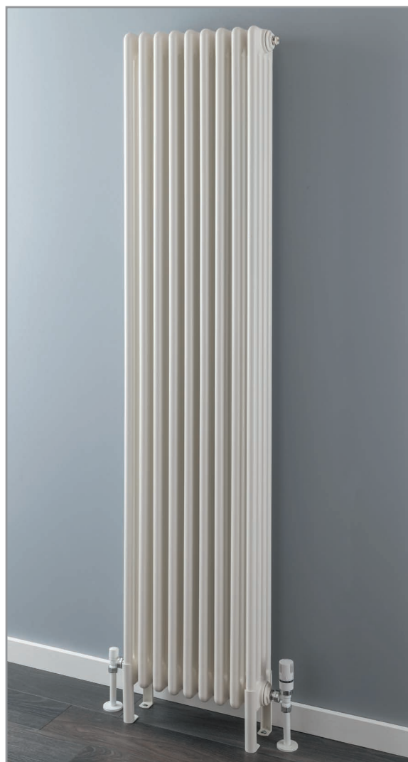
CORNEL 4 column 1800mm x 431mm in special finish Matt White with optional slip on welded feet & white Kingston TRVs & matching pipe covers & shrouds.