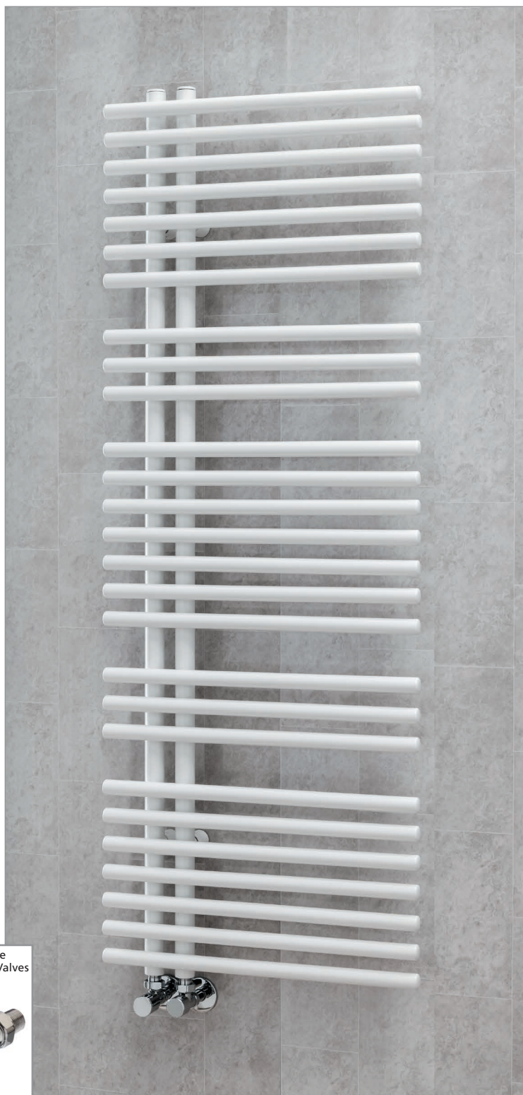
◆ 1348mm x 500mm in White RAL 9016 with DRAKE Valves.