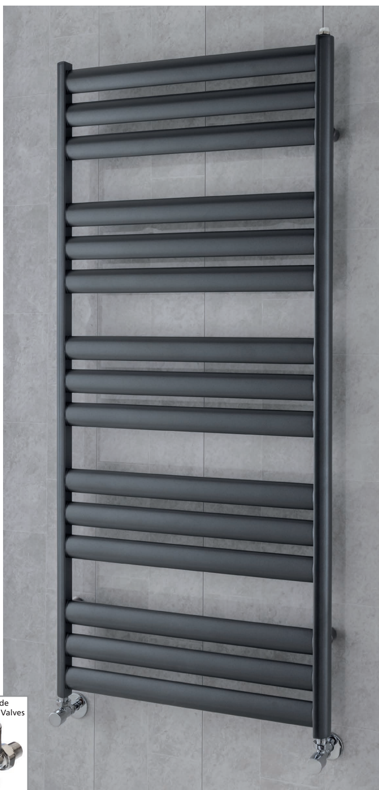
◆ 1340mm x 600mm shown in Gun Metal Grey with DRAKE valves & matching pipe covers & shrouds.