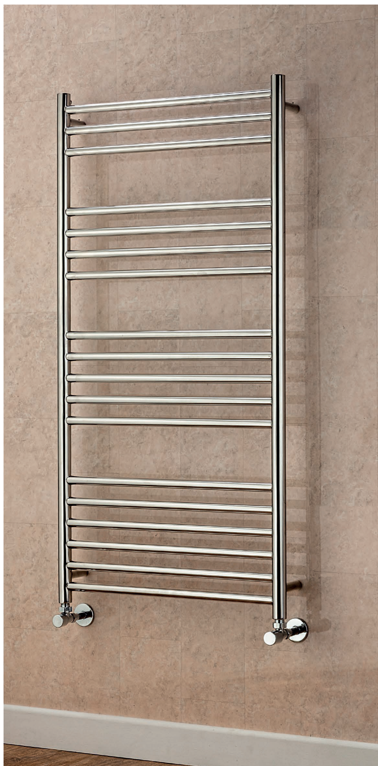
♦ LANARK Straight 1200mm x 500mm with Chrome DRAKE Valves