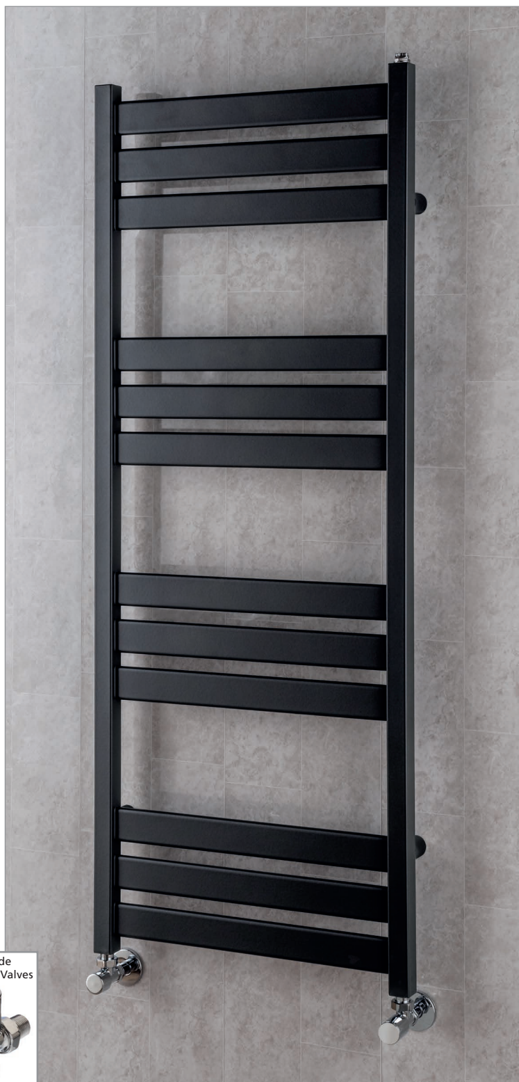
◆1290mm x 500mm in RAL 9004 Signal Black with DRAKE valves & matching pipe covers & shrouds