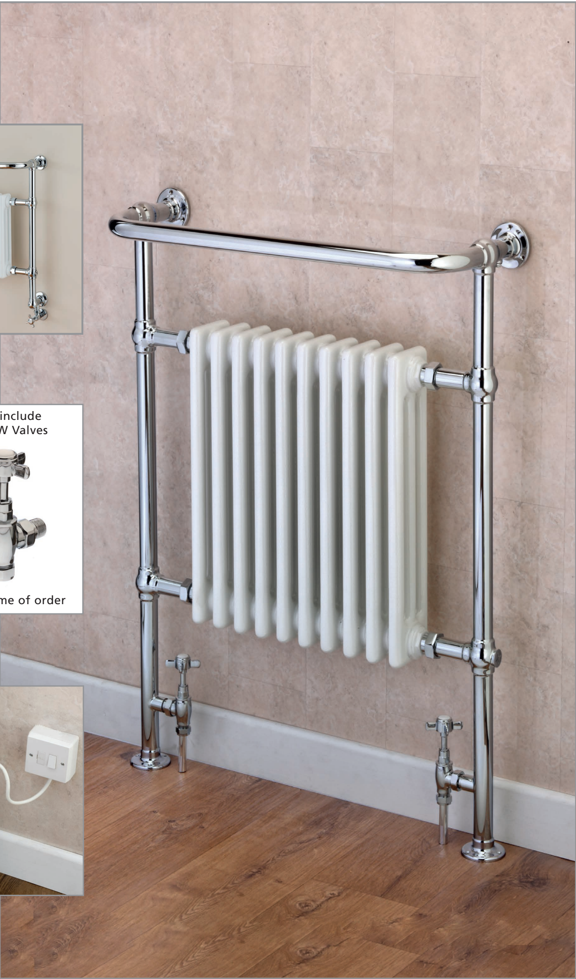
♦ BOLEYN Floor Standing 963mm x 763mm shown with WILLOW Valves.