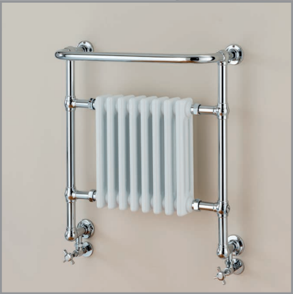
BOLEYN Wall Mounted option available