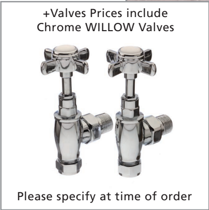
Please specify at time of order