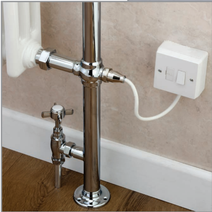
Dual Fuel option available